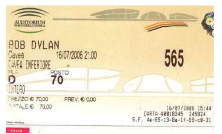
By courtesy of Michele Ulisse Lipparini. Session info updated 13 August 2020.