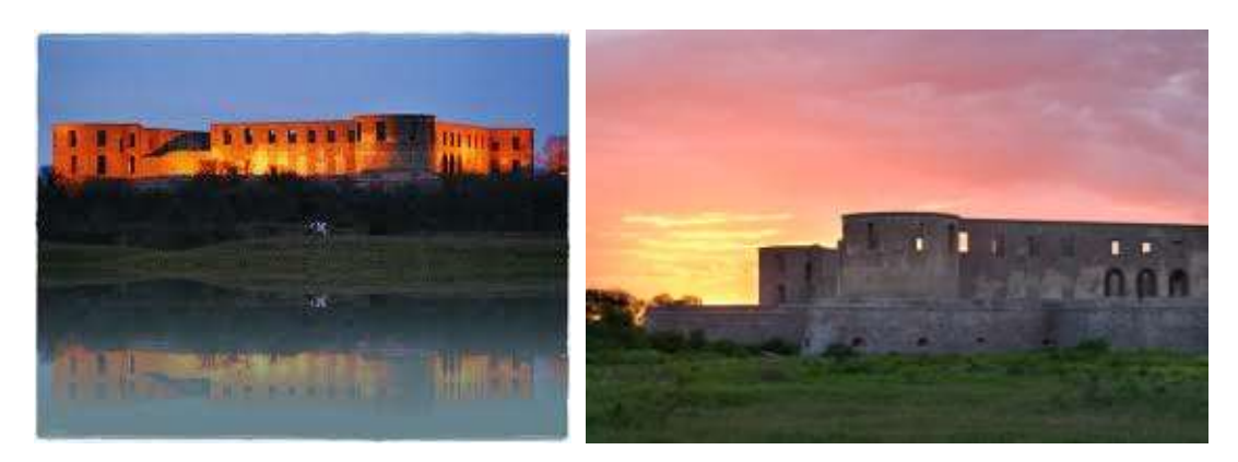
Session info updated 4 October 2012.