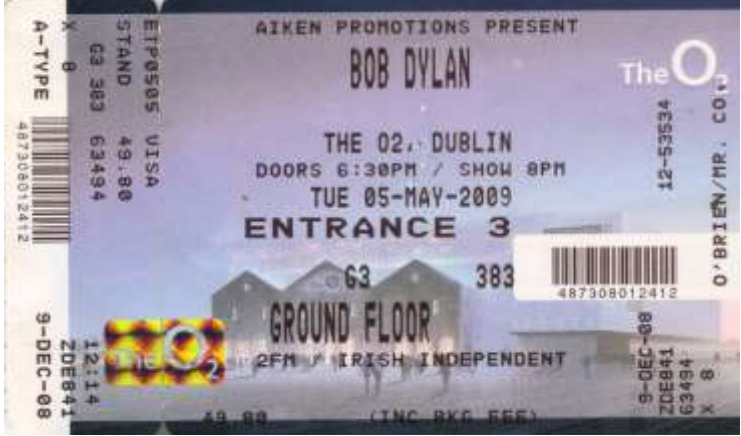
By courtesy of Michele Ulisse Lipparini. Session info updated 27 July 2020.

8 new songs (47%) compared to previous concert. 1 new song for this tour. Stereo audience recording, 115 minutes.