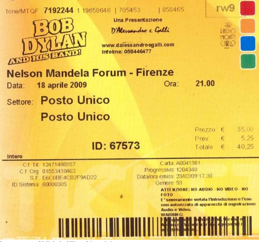
By courtesy of Michele Ulisse Lipparini. Session info updated 17 August 2020.