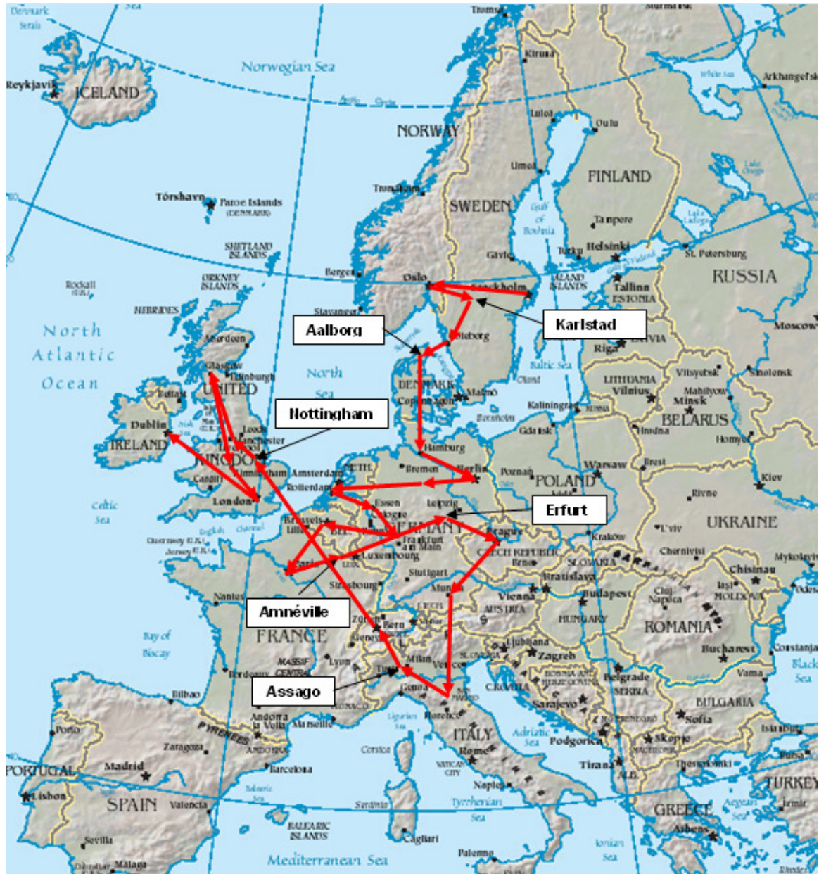
Bob Dylan: Still On The Road – 2005 Europe Fall Tour