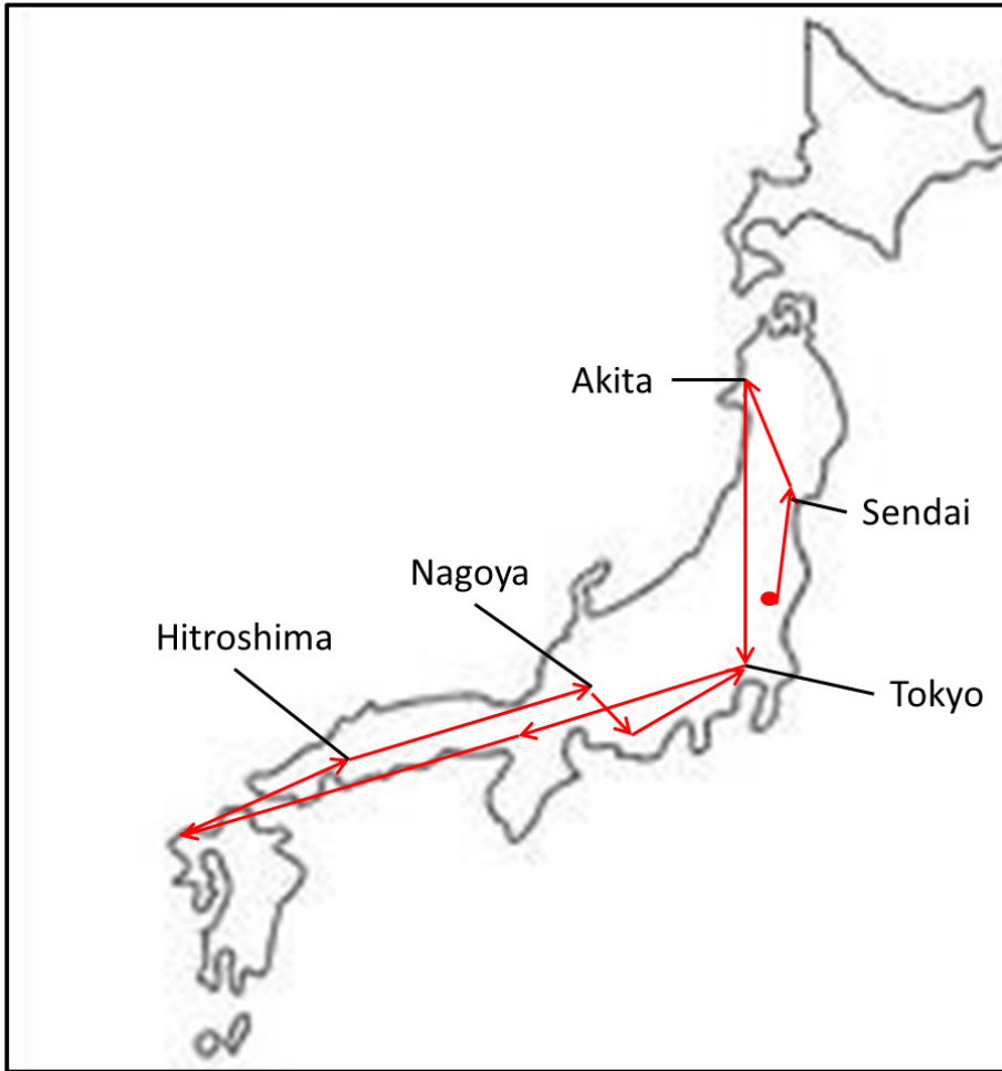
Bob Dylan: Still On The Road – The 2001 Tour of Japan