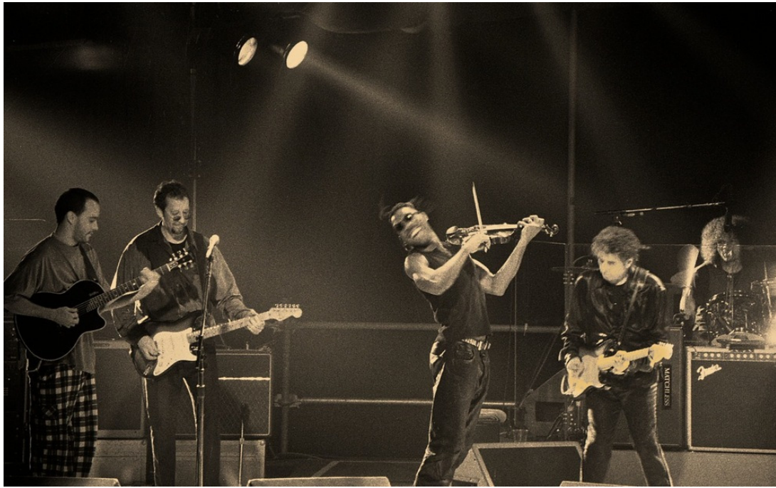
Bob Dylan: Still On The Road – 1996 Europe Summer Tour