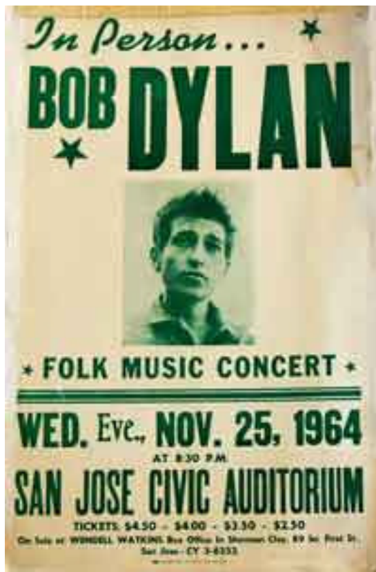
Bob Dylan recording sessions, interviews and concerts 1964