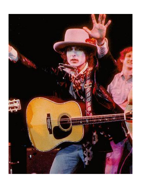
© 2002 by Olof Björner All Rights Reserved.

This text may be reproduced, re-transmitted, redistributed and otherwise propagated at will, provided that this notice remains intact and in place.