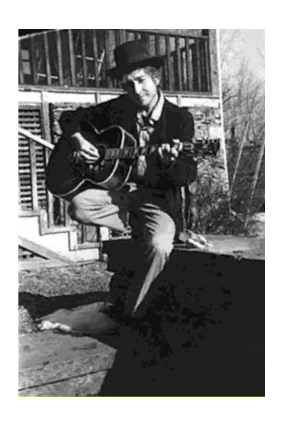
© 2001 by Olof Björner All Rights Reserved.

This text may be reproduced, re-transmitted, redistributed and otherwise propagated at will, provided that this notice remains intact and in place.