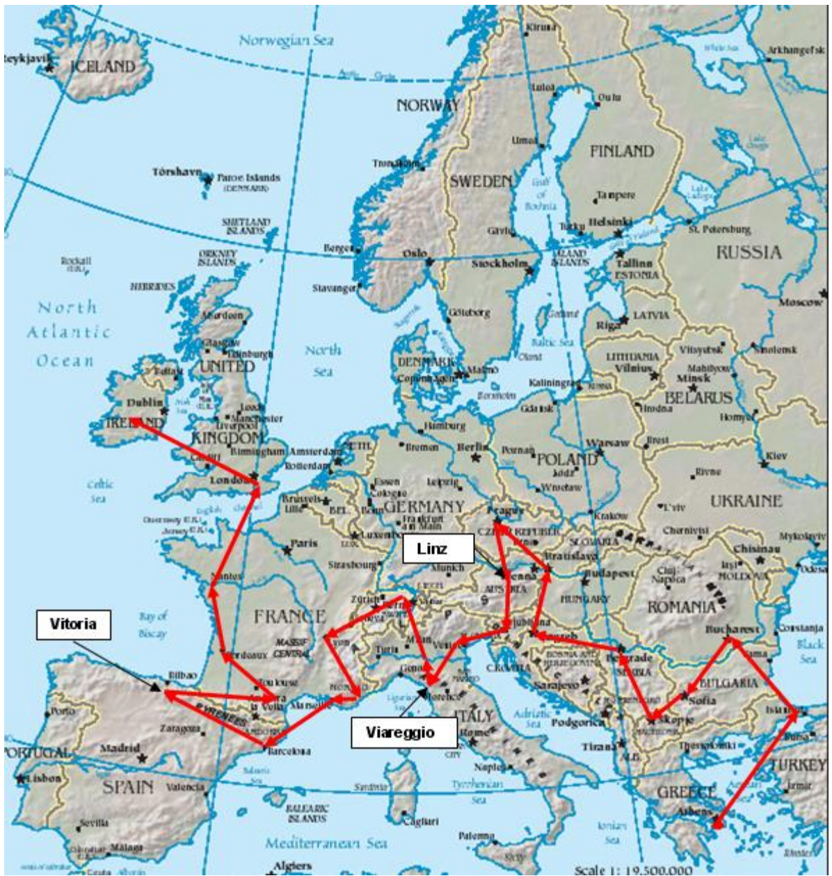
Bob Dylan: Still On The Road – 2010 Europe Summer Tour