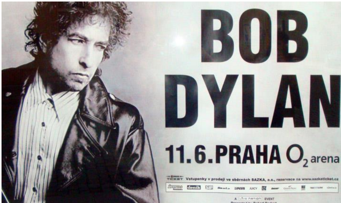
Bob Dylan: Still On The Road – 2010 Europe Summer Tour