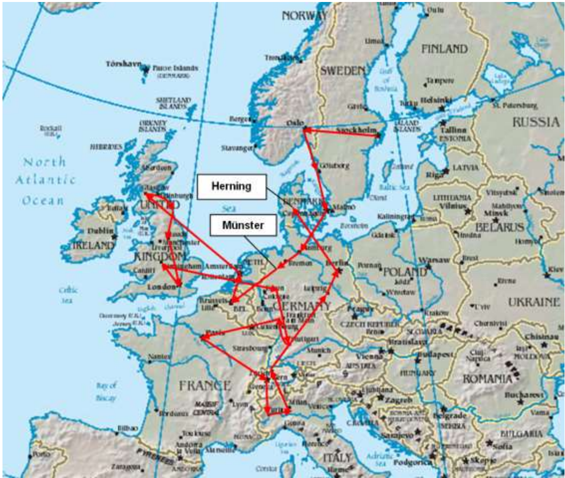
Bob Dylan: Still On The Road – 2007 Europe Spring Tour