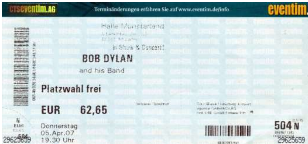
By courtesy of Michele Ulisse Lipparini. Session info updated 8 August 2020.