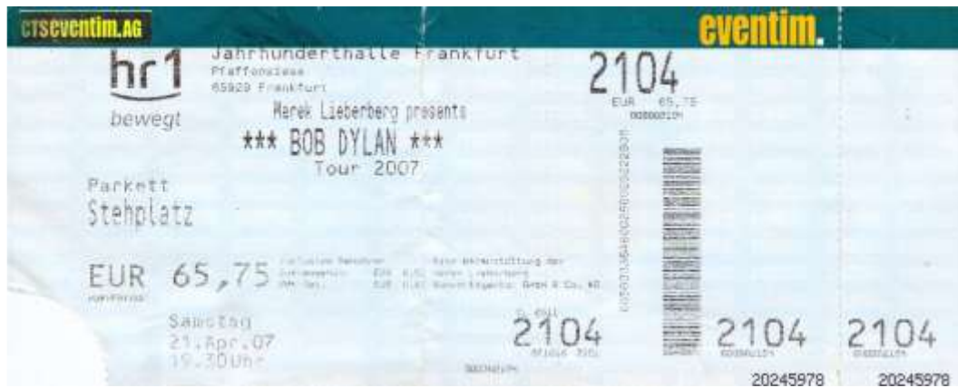
By courtesy of Michele Ulisse Lipparini. Session info updated 17 August 2020.